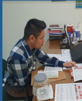
FY19 Actual Expenses - Local