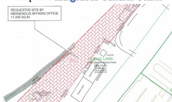
Indigenous Affairs Office, Capitol H