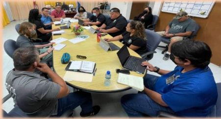
Finalizing FEMA Projects on Rota