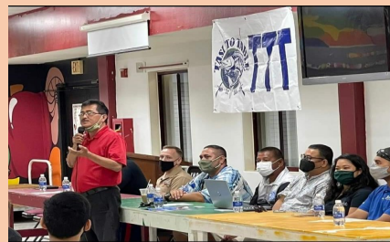
TTT's start of the 8 month program kicked off Saturday ,Oct. 02, 2021