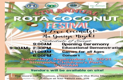
The 6th Annual Coconut Festival kick off September 15, 2021.