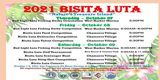
The Mayor of Rota Efraim M. Atalig, invite the community to join the festivities, as the Bisita Luta 2021 celebration will continue to show Rota local delicacies natural beauty, and treasured hospitality.