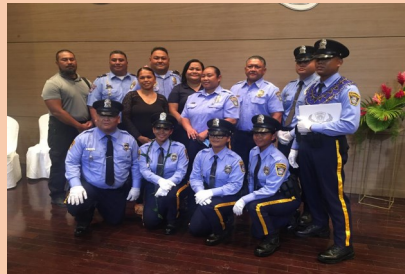
September 11, 2021 Graduation for the Police Cadets and Conservation Officers