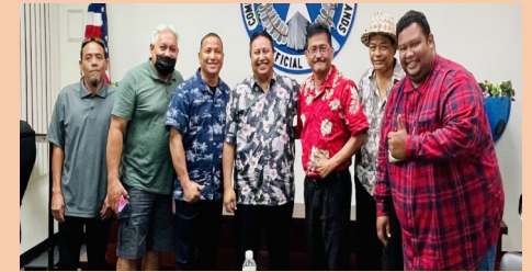
Rota Island Specialty Crop Association Distributes Funds to Rota Producers. RISCA held its 2021 annual membership