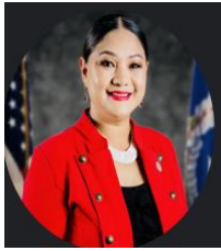
CHAIRWOMAN, COMMITTEE ON GAMING

Office of Senator Corina L. Magofna 24 th NORTHERN MARIANAS COMMONWEALTH LEGISLATURE HONORABLE JESUS P. MAFNAS BUILDING, CAPITOL HILL P.O.BOX 500129 SAIPAN, MP 96950 (670) 664-8812 Senator.CorinaMagofna@gmail.com