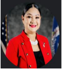
CHAIRWOMAN, COMMITTEE ON GAMING

Office of Senator Corina L. Magofna 24 th NORTHERN MARIANAS COMMONWEALTH LEGISLATURE HONORABLE JESUS P. MAFNAS BUILDING, CAPITOL HILL P.O.BOX 500129 SAIPAN, MP 96950 (670) 664-8812 Senator.CorinaMagofna@gmail.com