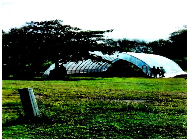
Tinian DLNR F.Y. 2024 FORESTRY PROJECTS.