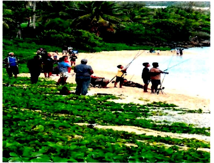
Tinian DLNR DFW 2024 Summer Youth Fishing Derby.