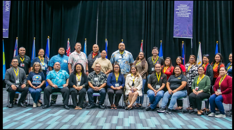
CNMI Delegation APIPA 2024 ANNUAL CONFERENCE