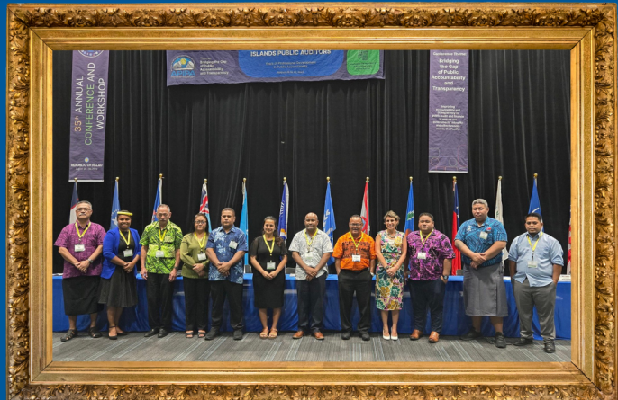
ASSOCIATION OF PACIFIC ISLANDS PUBLIC AUDITORS (APIPA)