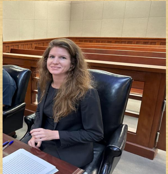
Right, lawyer taking the oath to practice law. Left, getting ready to argue to the Supreme Court.