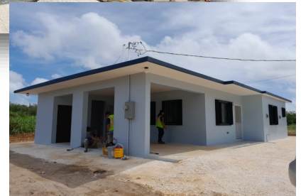
Completed residential structure