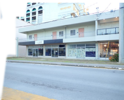
...after clearance of overgrown vegetation