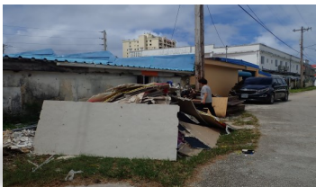
Ongoing enforcement on public nuisance