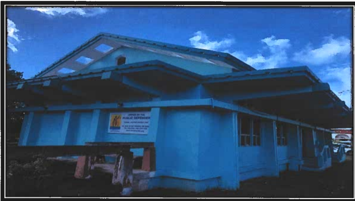
Public Defenders Office is located in Susupe, Civic Center Complex. Building is in between The Multi-purpose Center and The Joeten-Kiyu Public Library.