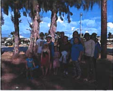
2021 Island-wide cleanup